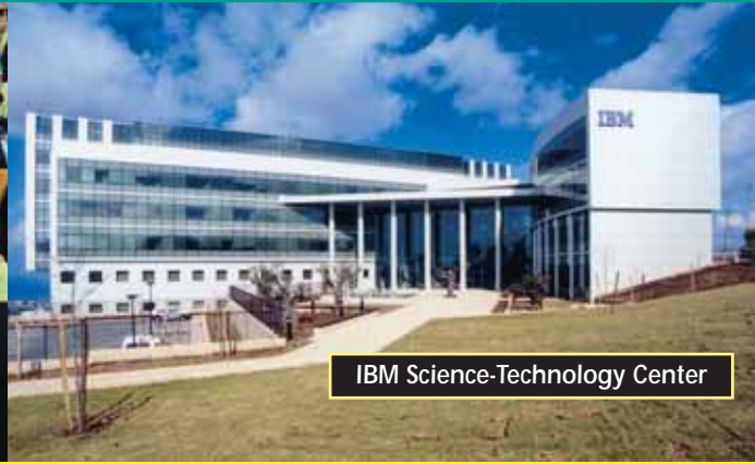
IBM Science-Technology Center