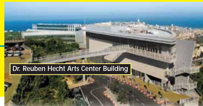
Dr. Reuben Hecht Arts Center Building