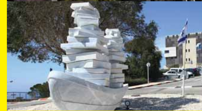
Rabin Complex for the Faculty of Social Sciences